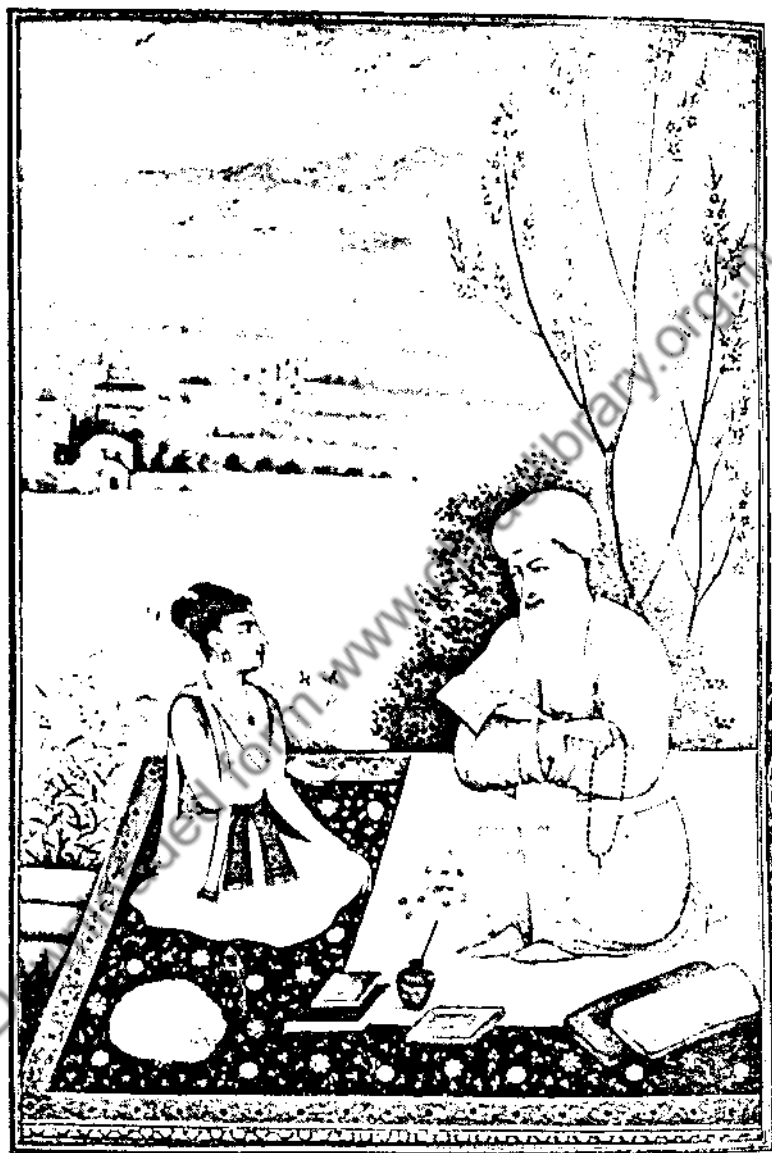
JAHANGIR IN HIS YOUTH (DARA SHUKOH ALBUM).